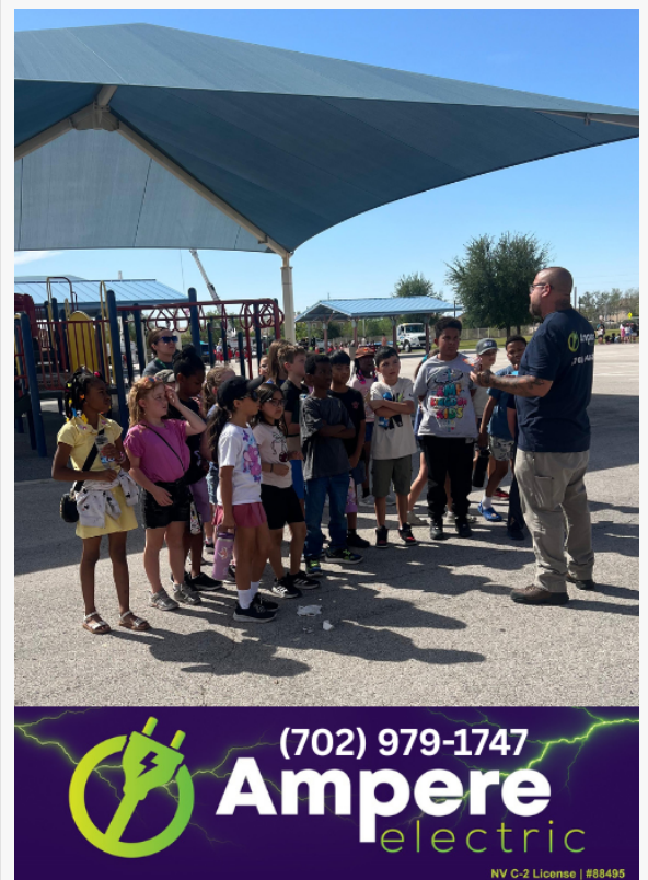
Career Day Goynes Elementary School North Las Vegas