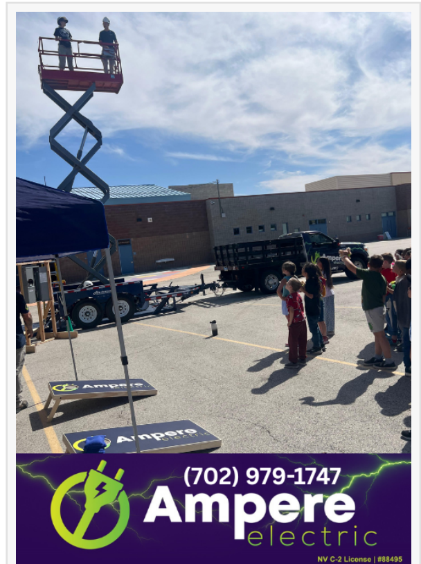
Ampere Electric Electricians - Career Day Goynes Elementary School

Ampere Electric is a licensed electrical contractor in Las Vegas offering commercial and residential electrical installation and repair service valley wide. Ampere Electric is the largest electrical installation services company in the valley and offers 24/7 emergency electrical service . Ampere Electric has been ranked No. 5 in the Inc. Regionals: Rocky Mountains list for 2026– the most prestigious ranking of the fastest-growing privately held companies in the Rocky Mountains. Dedicated to quality craftsmanship, transparency, and community safety, Ampere Electric provides comprehensive residential and commercial electrical services, from panel upgrades and lighting installations to emergency repairs.