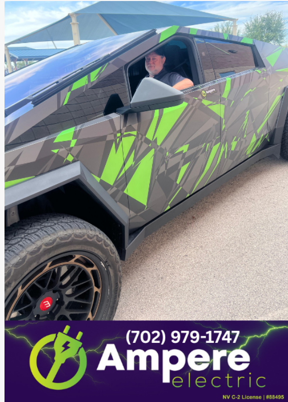
Ampere Electric Cyber Truck