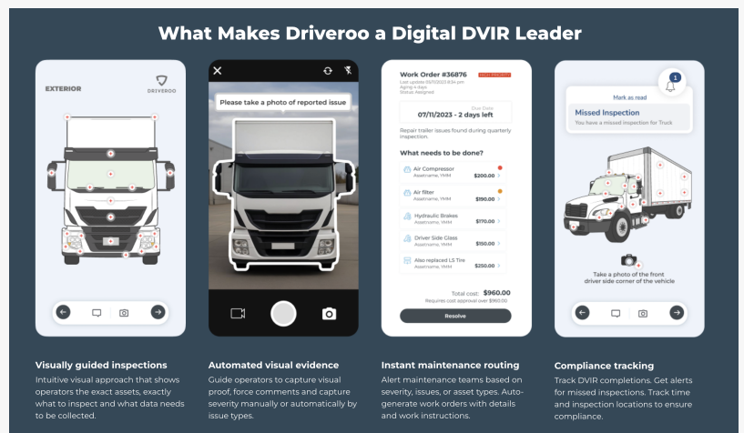
Automations simplify and guide the end-to-end process

Driveroo, powered by ROO.AI, today announced that its mobile inspection and maintenance management platform directly addresses the heightened compliance and documentation