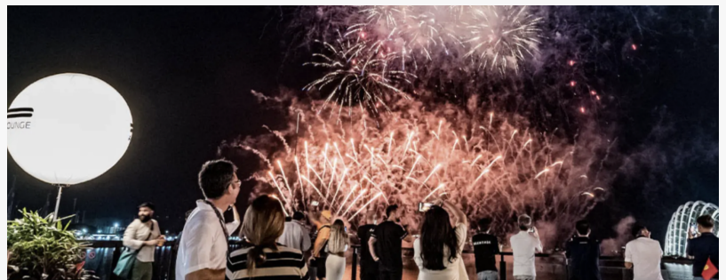
Spectacular fireworks illuminate the night sky during the iconic f1 singapore Grand Prix