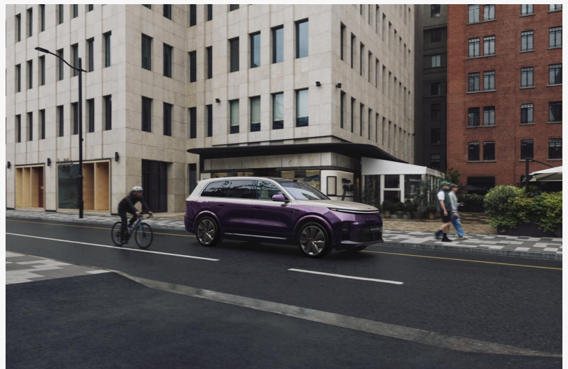
The All-New Li L9 Livis edition in Purple with Titanium Gold gliding effortlessly on the open road