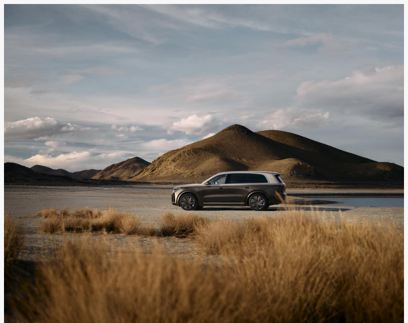
The All-New Li L9 Livis edition in Truffle Gold with Titanium Gold two-tone paint

creating a more commanding, elegant, and refined flagship appearance in both design and