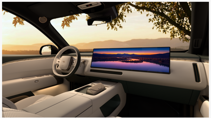
The All-New Li L9 offers a spacious six-seat cabin featuring the 29-inch panoramic screen

lianwan chen LiAuto 131 2016 7142 email us here