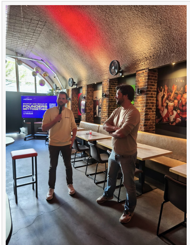
Upstream Founder Circle - A new concept designed specifically for founders who are already beyond the earliest stage of building and are now navigating the realities of growth, leadership, difficult decisions, and resilience.

One of the companies that benefited is Compone. The contribution enabled them to bring their product to further markets.