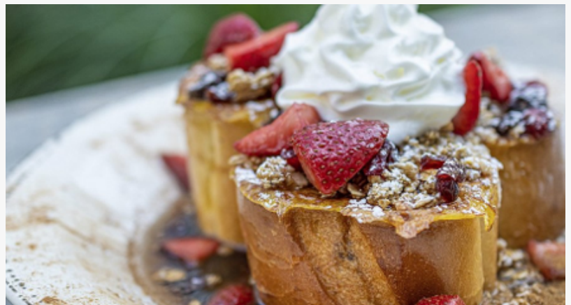
Billy's Berry Krunch