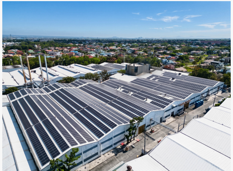
Liwayway Marketing Corporation Main Factory solar installation by Solaren, supporting industrial energy efficiency and long-term electricity cost reduction.