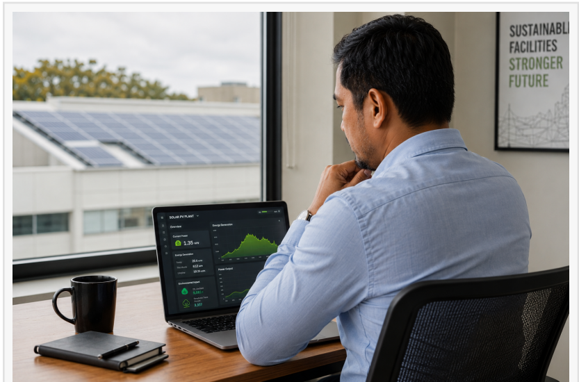
A commercial facility owner reviews energy data on a tablet, showing how better energy visibility supports smarter solar investment decisions.

Solaren Renewable Energy Solutions Corporation is a DOE-accredited, PCAB-licensed solar EPC company headquartered in Tarlac, Philippines, with more than 100 megawatts installed across