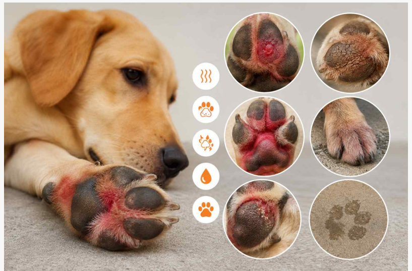
Dog paw burn symptoms