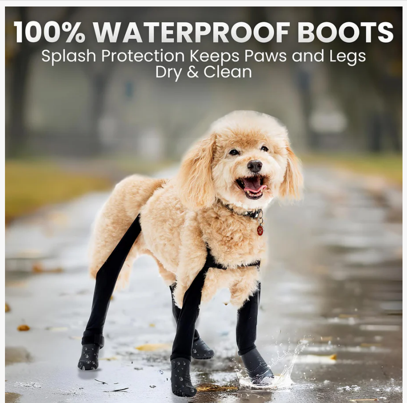
Walkee Paws dog boot leggings

prolonged exposure to sun-exposed surfaces. Pet owners are also encouraged to test pavement temperature manually before walking their dogs and to prioritize shaded walking routes where