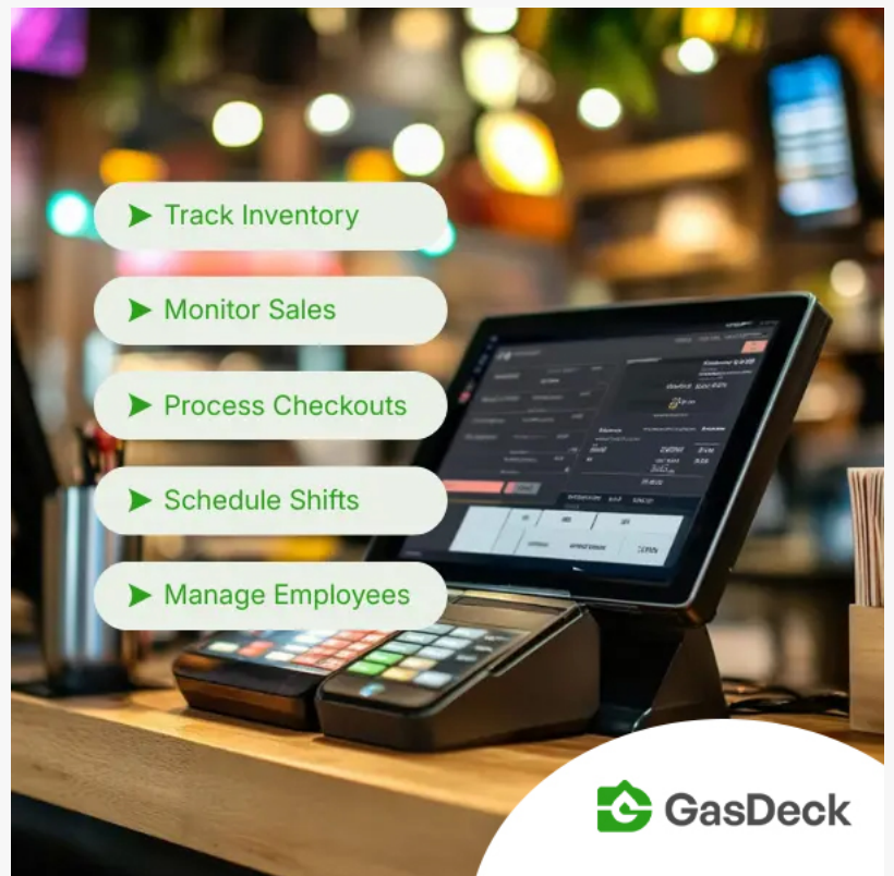
GasDeck in Action