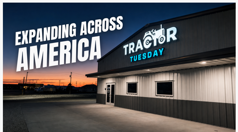
Tractor Tuesday HQ

HASTINGS, NE, UNITED STATES, May 19, 2026 /EINPresswire.com/ -- Tractor Tuesday announced today that its retail marketplace is rapidly expanding, with total inventory approaching 10,000 listings as leading dealership groups across the country join the platform.