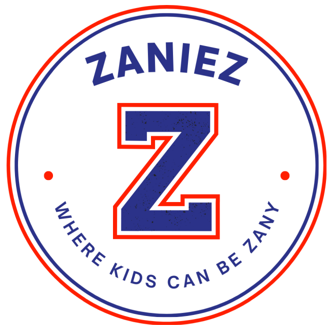
Zaniez Autism Farm Trade School

At Zaniez, Zippotherapy will serve as a cornerstone of the adult work-study program, directly supporting greater independence, vocational readiness, and confidence for participants of working age. Zippotherapy will create a foundation for older students to embrace entrepreneurship, as appropriate and desired.