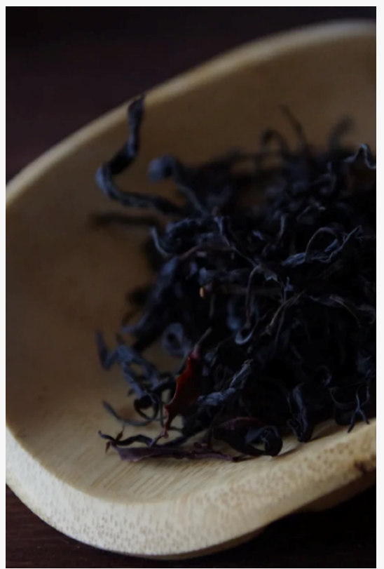
The Private Vintage: Pu-er Collection

The fundamental pillars of the House's seasonal offerings. The Atelier Series features vibrant, single-origin Green and Black teas meticulously harvested from protected high-altitude terroirs. Engineered for daily cognitive calibration, the Green tea preserves a pristine, unoxidized concentration of pure L-theanine for instant alpha-wave focus, while the Black tea offers a rich, deeply oxidized profile that provides sustained, smooth metabolic vitality without the jittery spike of standard caffeinated beverages.