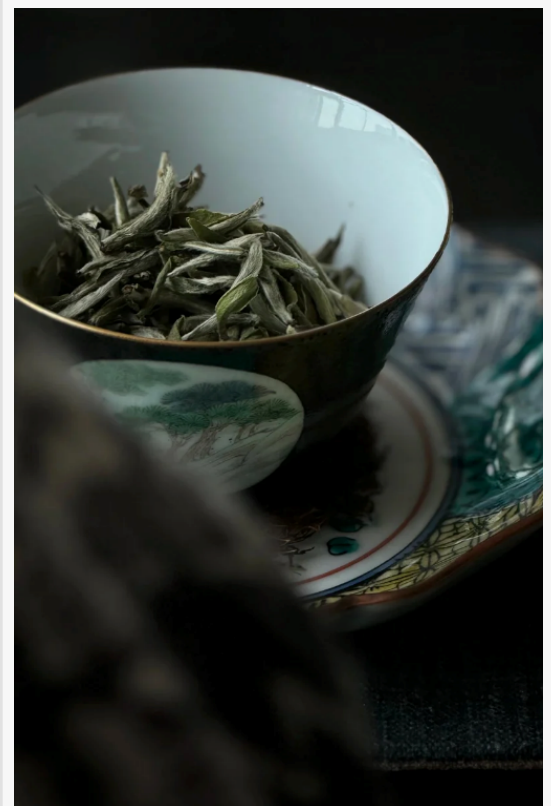
The Curated Reserve: White Tea Collection

This distinct neurological state is driven by the structural pairing of L-Theanine (N-ethyl-L-glutamine) and complex, polyphenol-bound caffeine molecules. Operating in harmony, these compounds induce Alpha-wave synchronization (8–12 Hz) within the brain—the precise neural