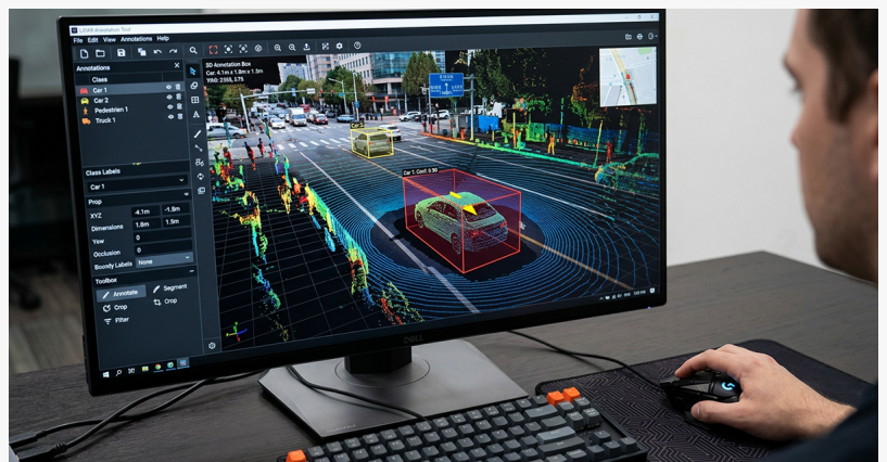
Annotation for a global automobile company