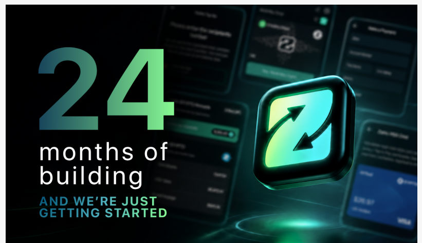
Zypto 24 Months of Building the Crypto Super App

ŁÓDŹ, ŁÓDZKIE, POLAND, May 21, 2026 /EINPresswire.com/ -- Zypto App marks its second anniversary after 24 months spent bringing together an extensive range of blockchain ecosystems, stablecoins, swaps, payments, self custody and real world crypto utility into one connected crypto environment.