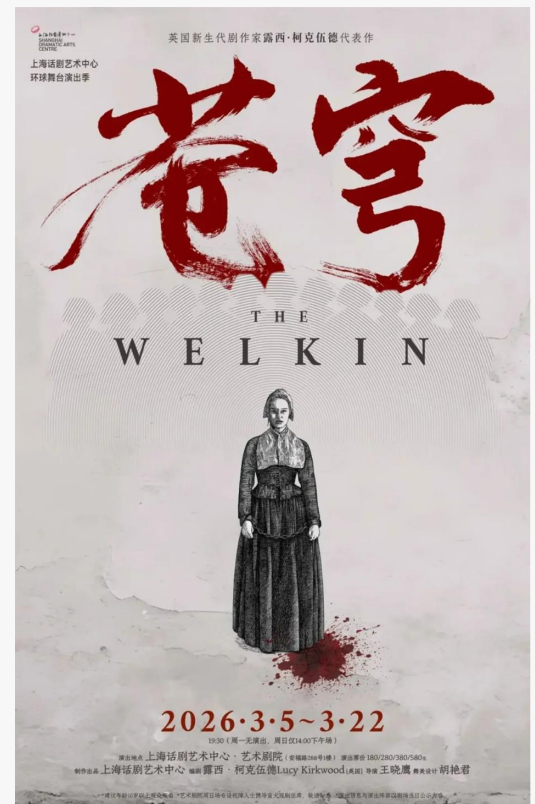
The Welkin Poster