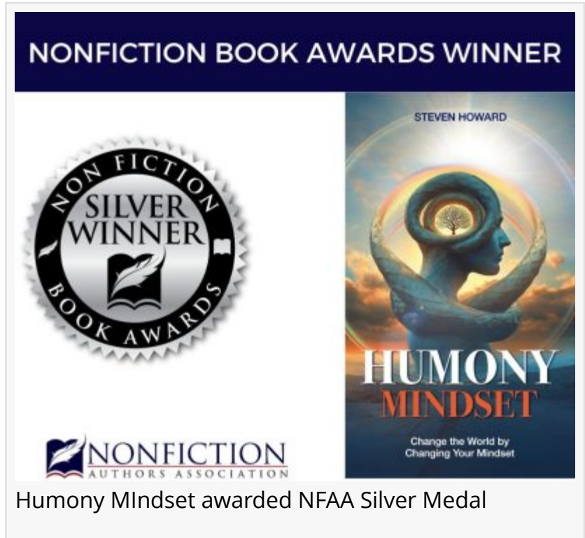
Humony Mindset awarded NFAA Silver Medal

The Nonfiction Authors Association has awarded HUMONY MINDSET: Change the World by Changing Your Thinking a Silver Medal.