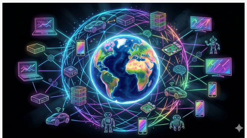
a planetary compute mesh connecting billions of devices and AI systems.

This planetary compute mesh is coordinated by AI and structured around a local "currency" first economic model, ensuring accessibility for individuals and communities while supporting regional digital participation. Each connected device becomes part of a wider compute layer capable of supporting AI workloads, automation, and next-generation digital services.