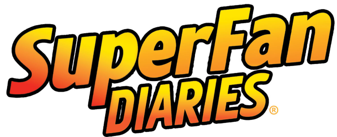
SuperFans Diaries Logo