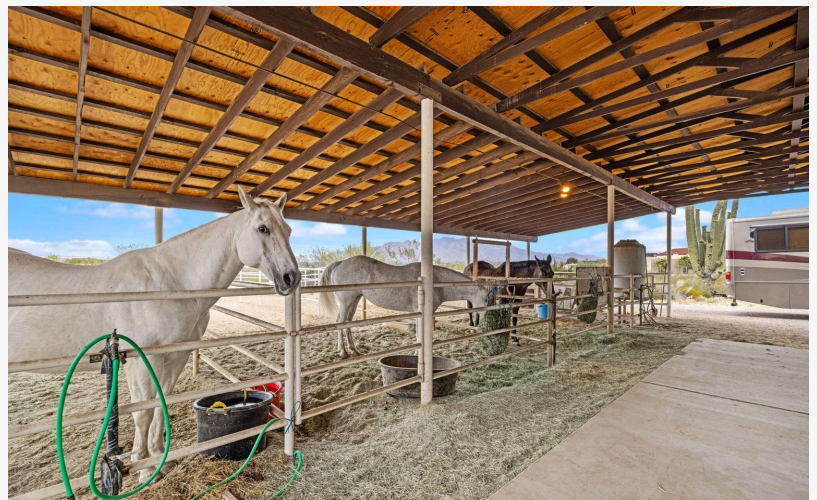
Your Horses Will Thank You. Shaded center walkway, tackroom, and long stalls. Every detail is here