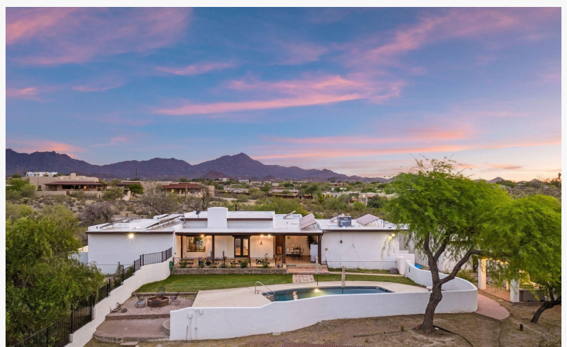
Tucson Mountains Corridor. No HOA. No Compromises.

TUCSON, AZ, UNITED STATES, May 21, 2026 /EINPresswire.com/ -- A rare turnkey equestrian estate has officially hit the market in Tucson's highly sought-after Tucson Mountains Corridor. Located at 5060 N Camino De Oeste, this custom Spanish ranch offers an increasingly difficult combination to find in Southern Arizona: a fully operational horse property paired with a thoughtfully remodeled luxury residence on 5.57 acres with no HOA restrictions.