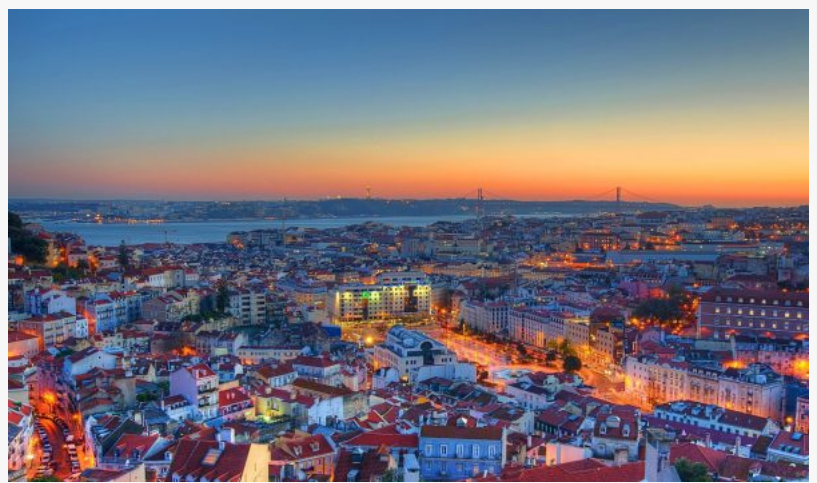
Lisbon Overview, Portugal

The ICCA Country and City Rankings are drawn from ICCA's Business Intelligence platform, which catalogues meeting editions, meeting series and international associations worldwide. The 2025 edition, published as part of the ICCA GlobeWatch series, analyses rotating international association congresses and provides additional insight by region, meeting size and sector.