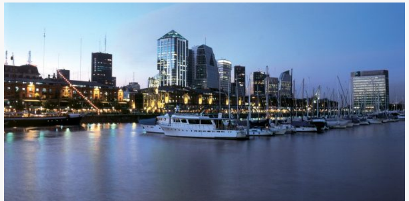
Buenos Aires, Argentina