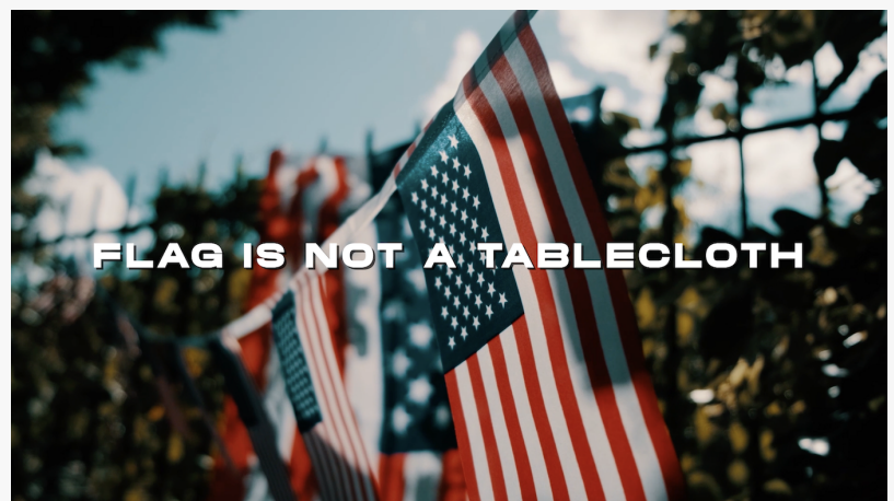
Flag Is Not A Tablecloth - "Freedom's Not A Game" - M.Lev