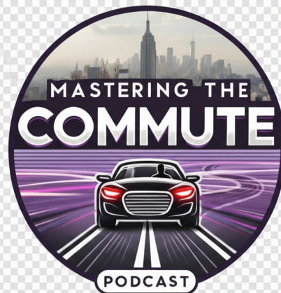
"Mastering the Commute" Podcast - Available on All Major Podcast Platforms