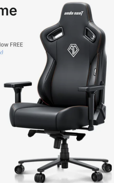
2026 Memorial Day Sale AndaSeat Kaiser 3e