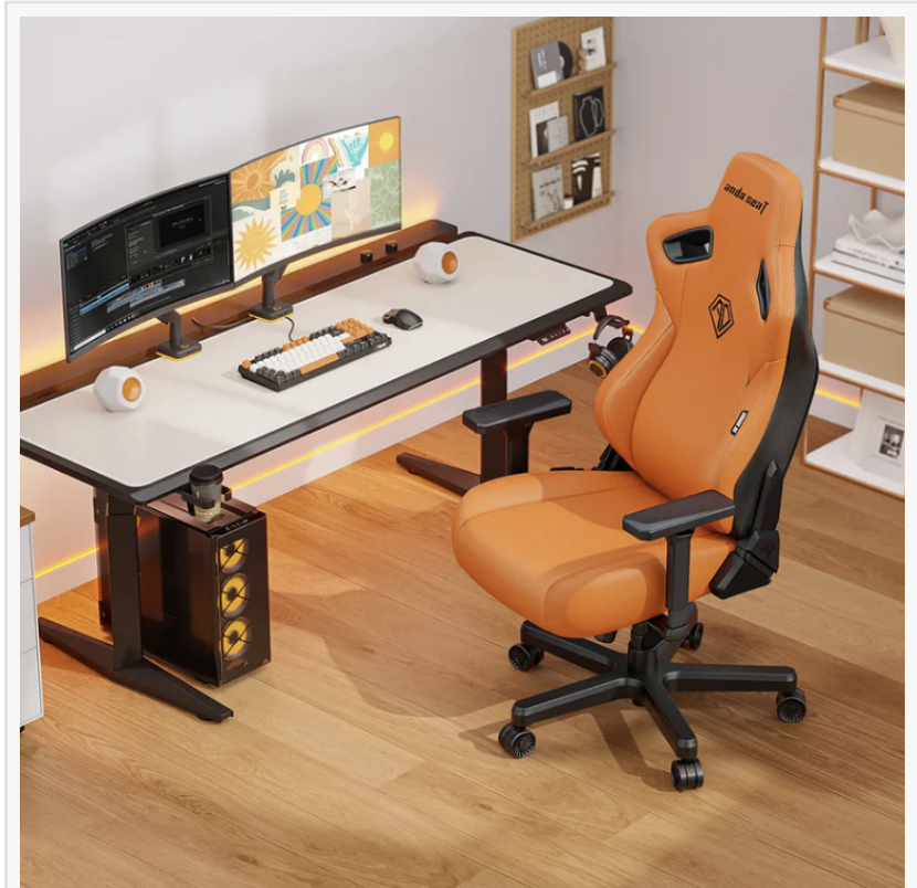
Kaiser 3E AndaSeat Orange Setting

That tension has become more noticeable as consumers compare chairs more closely over time rather than only at the point of purchase. A chair may appear well equipped on paper, but if its core shape does not support the back on its own, the user may still feel that the chair's ergonomic value depends too much on external adjustments. In practical terms, many buyers are now paying more attention to whether the seatback itself has a meaningful ergonomic profile.