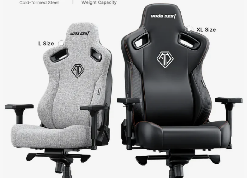
Kaiser 3E Size