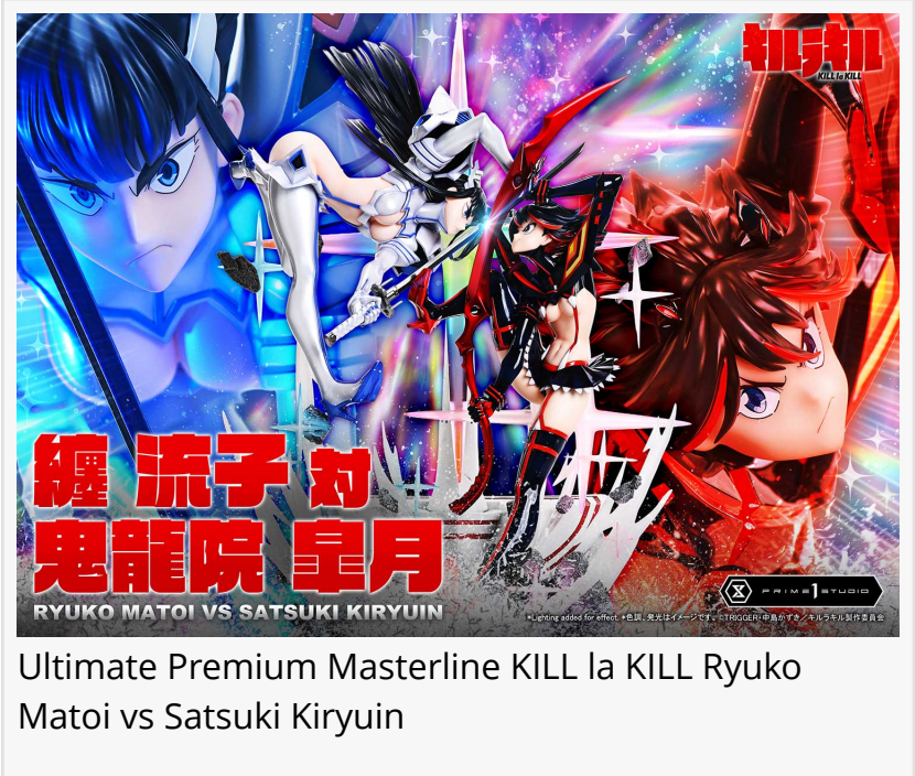
Ultimate Premium Masterline KILL la KILL Ryuko Matoi vs Satsuki Kiryuin

The Bonus Version also includes an acrylic name block with a floating-style design and typography inspired by the series logo.