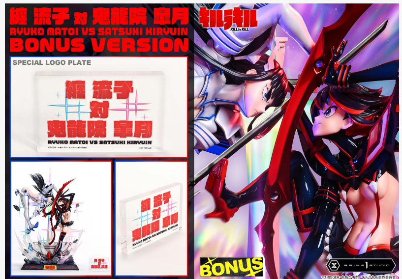
Logo Acrylic Block

This press release can be viewed online at: https://www.einpresswire.com/article/914887111