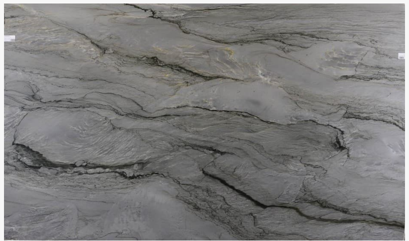
marble kitchen countertops New Castle