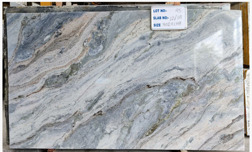
Marble Countertops in New Castle

Marble countertops have become a defining feature in contemporary homes. Their smooth finish, natural veining, and classic appeal make marble countertops one of the most versatile materials available for interior spaces. So, whether homeowners are renovating an outdated kitchen or designing a custom bathroom vanity, marble surfaces deliver an unmatched combination of functionality and beauty. Keystone Marble and Granite understands this surge in demand for authentic as well as long-lasting countertops, and, thus, offers a wide range of