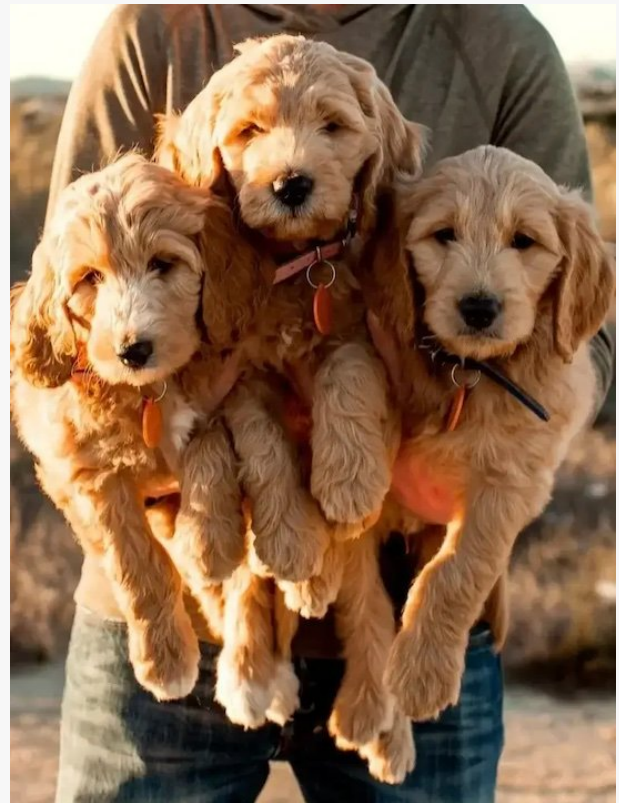
goldendoodle breeders in southern California