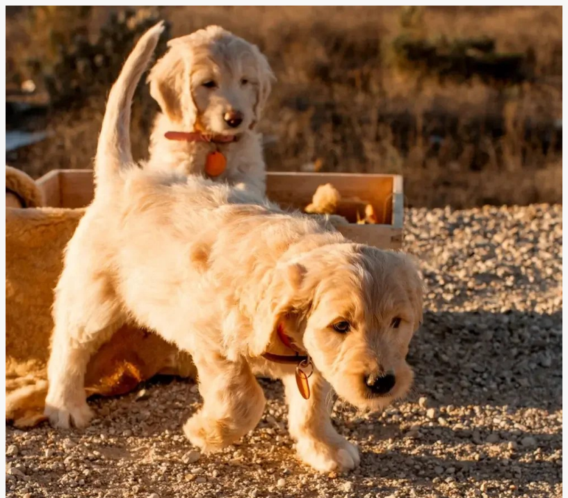
goldendoodle breeder in Bay area

Windsong Doodles, LLC as a cc describes its setup as a home environment where puppies are raised inside a real household. They are not separated into isolated spaces or distant facilities. Instead, they are part of normal home life from the beginning.