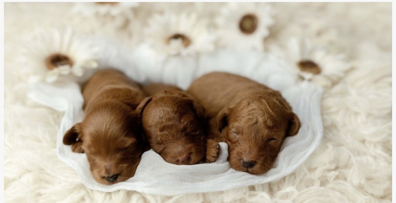
goldendoodle breeder in California