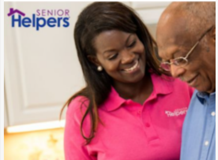
Senior Helpers Caregiver