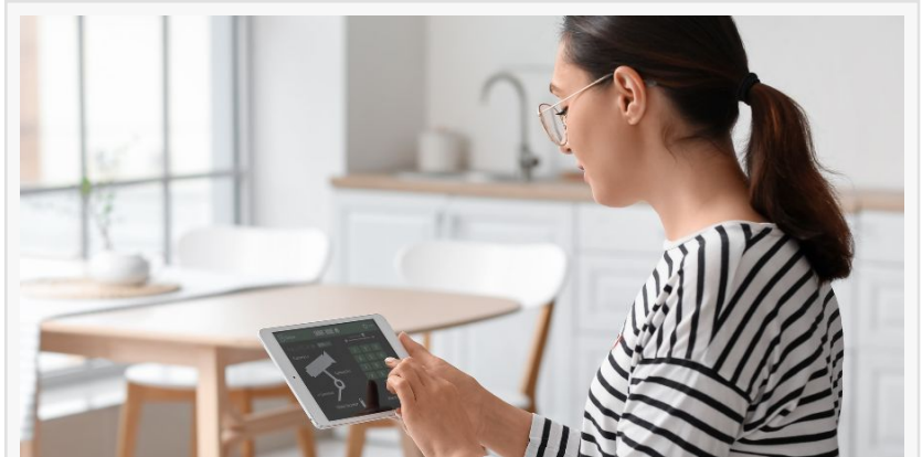
Smart Home Security in the palm of your hand

Concerns about property crime are leading more homeowners to invest in smart security technology . Modern systems now offer features such as remote monitoring, automated locks, and real-time alerts that provide greater control and visibility.