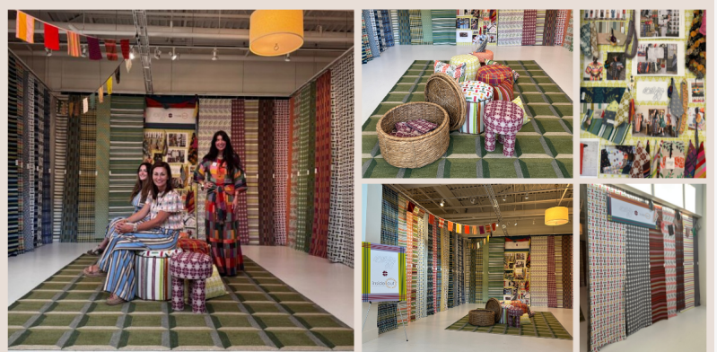
Valdese Weavers, premiers collab with fashion house Ace & Jigs