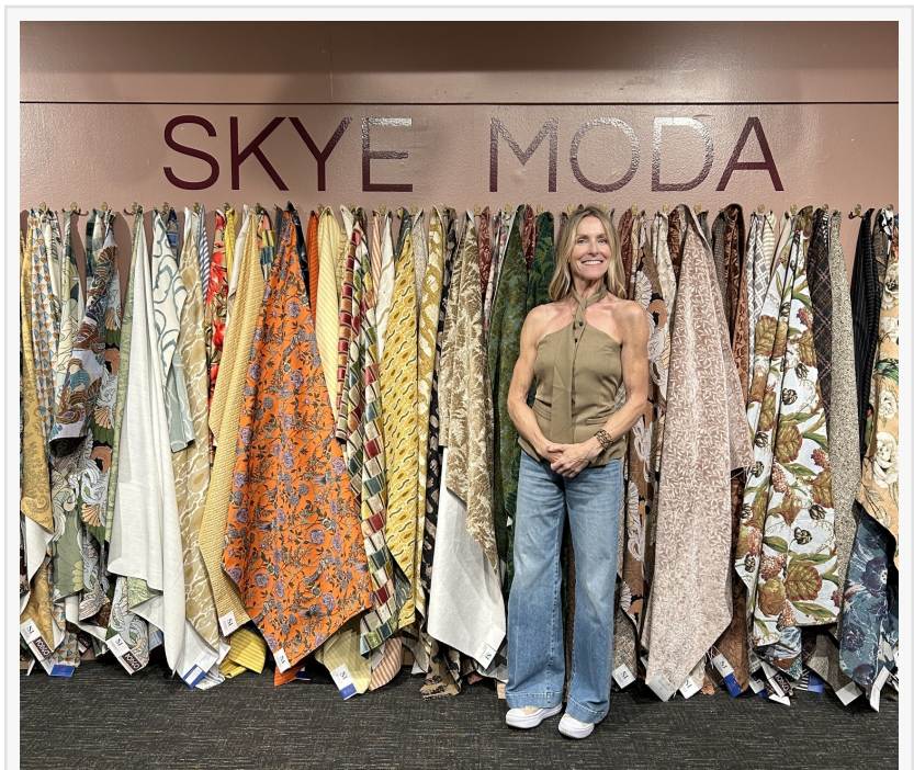
New to the scene, Skye Moda, whose tagline "The Skye's the limit and the plan was never to blend in" premiered an exquisite 150 piece collection of residential textiles in a gorgeous array of colors and patterns.

Reliability meets affordability brand Revolution Fabrics, known for their performance, stain resistance, PFAS-free bleach-cleanable fabrics with more than 2000 total skus. debuted 90 new designs within several new collections. Notable new collections, Savannah is a reimagining of southern traditions with classic treasured patterns in new colors and textures, Taos which