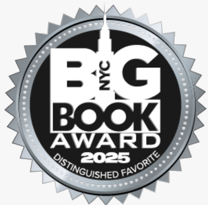
NYC Big Book Award Distinguished Favorite