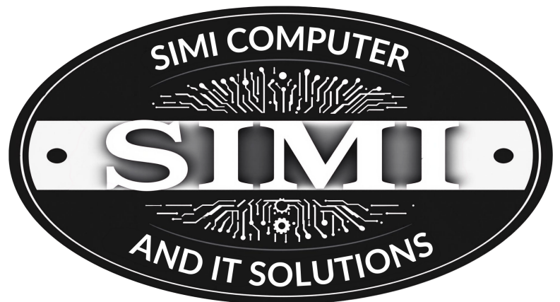
Simi Computer and IT Solutions Logo