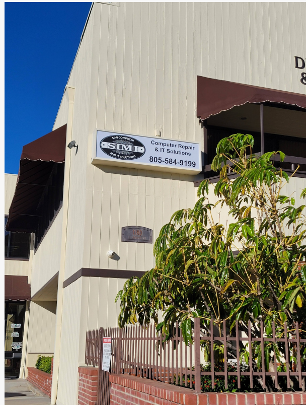
Building Sign - Simi Computer and IT Solutions

Simi Computer and IT Solutions has over 30 years of experience protecting computers, servers and networks.