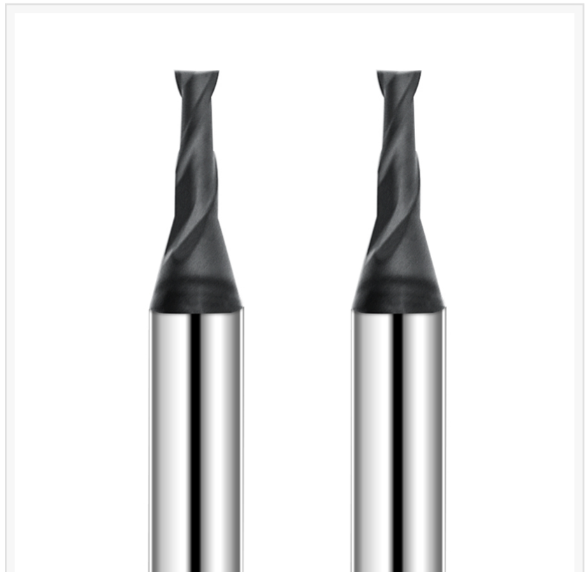
graphite end mills

Real-world machining tests show that under identical cutting parameters, SAMHO's diamond coated end mills outlast and outperform tools with traditional coatings. By reducing tool change frequency and costly machine downtime, they boost overall throughput and process stability—making them the go-to choice for high-precision graphite shops.