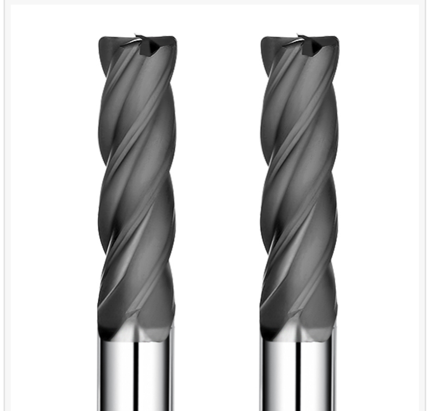
diamond coated end mill