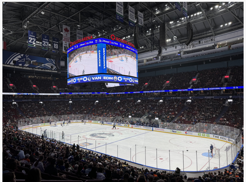
NHL Vancouver Canucks Stadium Renovation