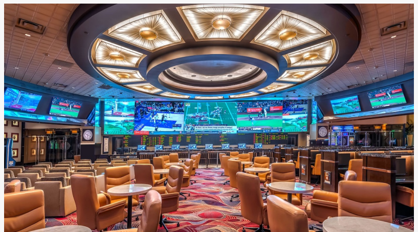
Atlantis Casino Resort Spa Reno, Race & Sports Book