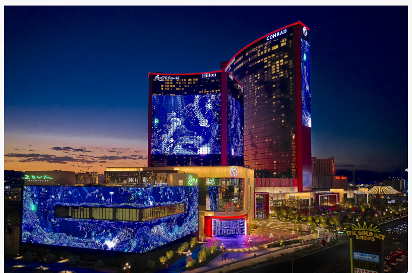
Resorts World Las Vegas

Headquartered in Las Vegas, Elite Displays provides a full range of services backed by 20 years of proven reliability: