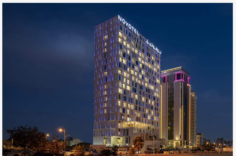
Novotel Riyadh Sahafa.

LUXEMBOURG, LUXEMBOURG, May 29, 2026 /EINPresswire.com/ -- With scenic Olaya street views, Novotel Riyadh Sahafa is located in the heart of Riyadh in Saudi Arabia between the central business district and the international airport. The hotel was recently awarded its inaugural Green Globe certification . Proximity and spacious modern rooms and suites make the 4-star hotel a prime choice for both business and leisure stays.