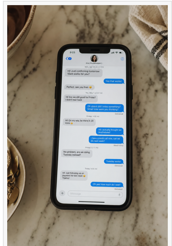
The old way. Photo shows a typical text conversation between a homeowner and their housekeeper.

A free guide covering the legal responsibilities of homeowners who employ household workers is available at housekeepertimekeeper.com/guide .