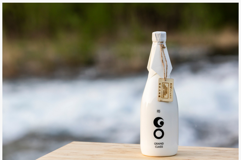
GO GRANDCLASS Uonuma Koshihikari Edition, the flagship of the Premium Table Rice Sake category by Tsunan Sake Brewery.

The case for the category begins with place. Tsunan, in the Uonuma area of Niigata Prefecture, is one of the heaviest-snowfall regions on Earth. That snow is not scenery — it is the mechanism. Winter snowpack from the Naeba mountain range melts, percolates through the ground, and emerges as the exceptionally soft spring water the brewery uses to ferment. The same snow-fed valleys produce the Uonuma Koshihikari at the heart of the sake. Snow to water, water to rice, rice to sake: the terroir of Tsunan is a single connected system, and it is what makes "why here" inseparable from "why this category." The new site devotes a full chapter to that chain, in every language.