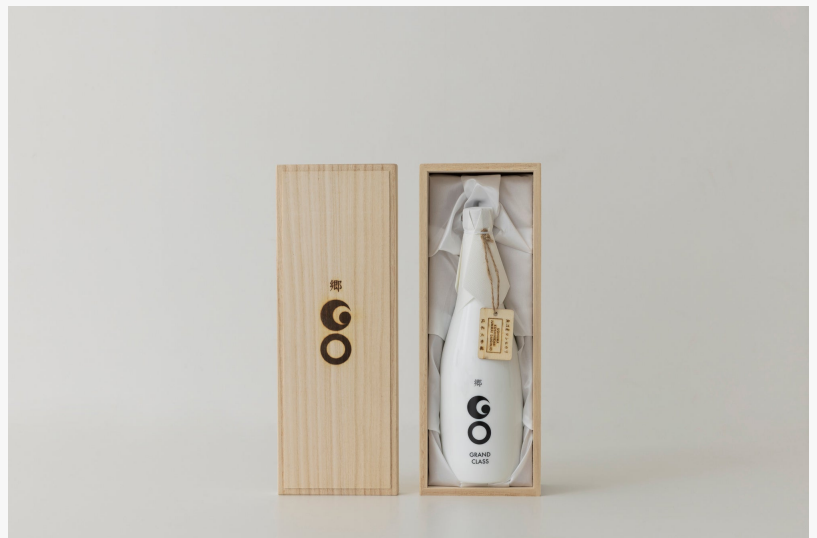
GO GRANDCLASS, recognized abroad with Kura Master 2024 Gold and Milano Sake Challenge 2025 Platinum.