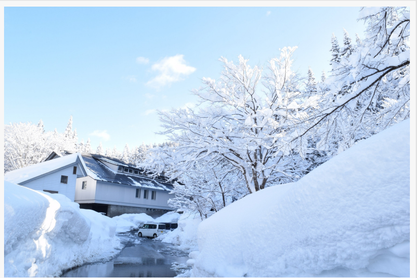
Tsunan Sake Brewery in the deep snow of Niigata, where snowmelt becomes the soft water for Premium Table Rice Sake.

Built for a multilingual, AI-mediated world