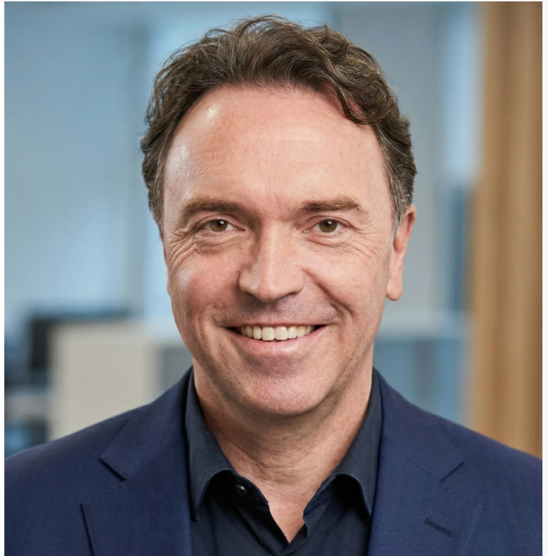
CEO & Founder TRANSFORMING.LEGAL & GOLT.ai

"We strive to provide the highest level of performance, precision, and excellence in everything our company delivers to our clients. To have our efforts validated by G.O.L.T. STAR is rewarding and distinguishes Draftwise as a level above in our industry. Our clients will be thrilled by this