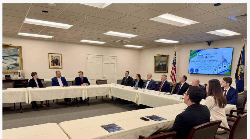
Pennsylvania National Security Briefing

HARRISBURG, PA, PA, UNITED STATES, June 2, 2026 /EINPresswire.com/ -- The Alliance for Global Security (AGS) today convened closed-door national security briefings for Pennsylvania state lawmakers, Shapiro Administration, and for the Commonwealth's business community in Harrisburg, bringing