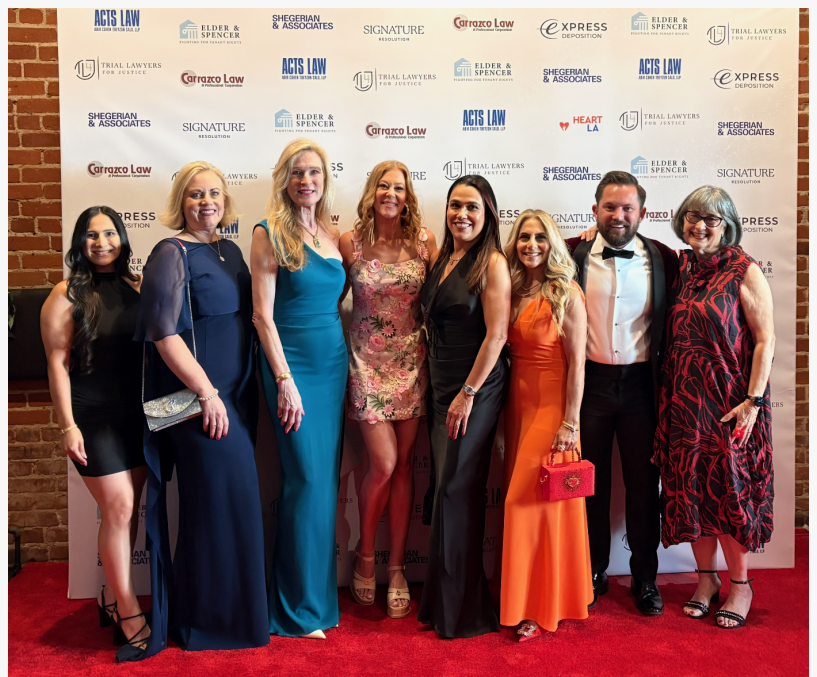
Attorneys and the Los Angeles Trial Lawyers Charities celebrating their 20th Anniversary Gala serving the LA community at the Candela La Brea