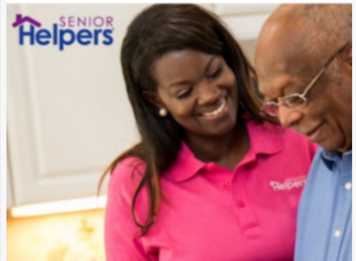
Senior Helpers Caregiver