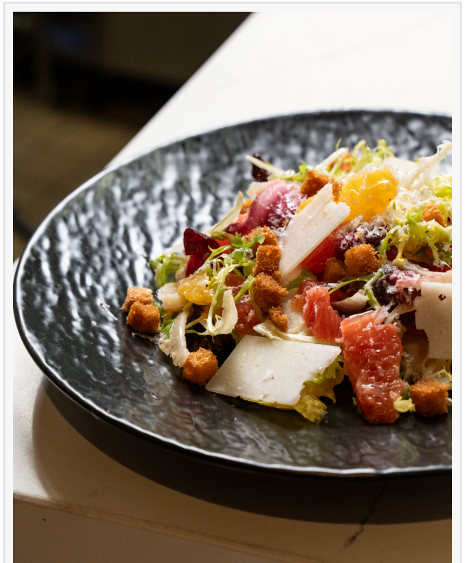
Anima Chicory Salad

Tickets for upcoming wine dinners can be purchased online.