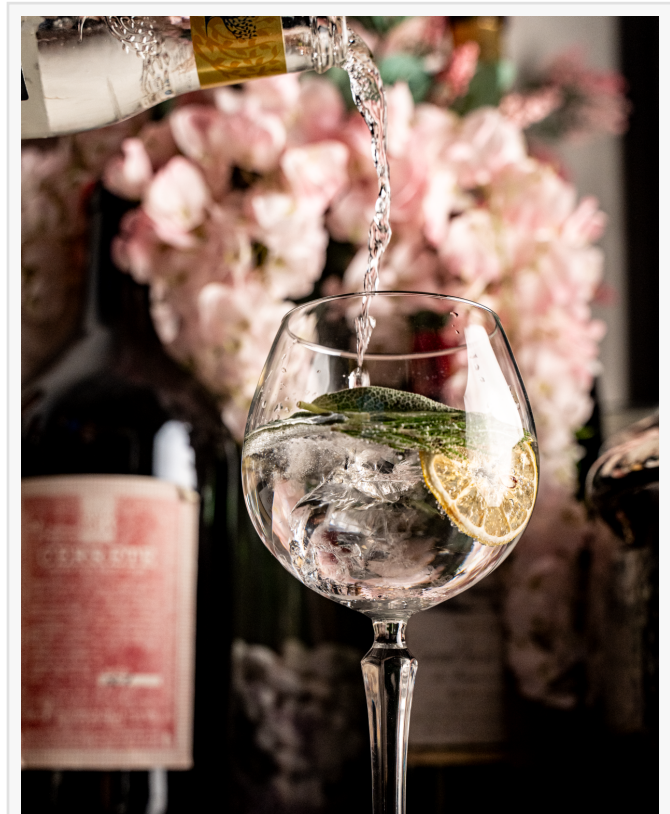
Braseria Gin and Tonic

Happy hour and reverse happy hour (4:30-6pm and 9-11pm) specials include team selected