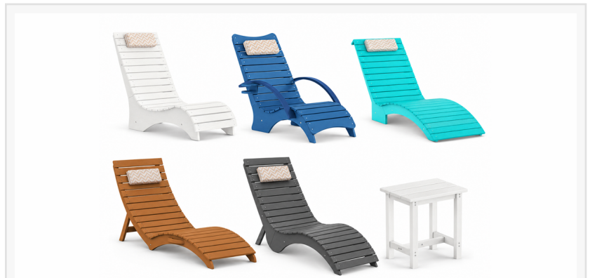
AquaCurve highlights HDPS material use across its shallow-water in-pool lounge chairs and matching side table.

The company also provides guidance for use in chlorinated and saltwater pools. AquaCurve products can be used in chlorine and saltwater pool environments, but the brand recommends waiting about 48 hours after adding pool chemicals so the water can circulate and stabilize before placing products back into the pool. This timing is especially important after shock