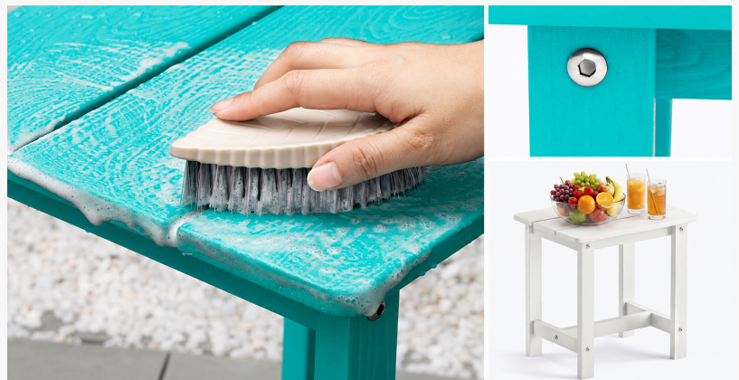
AquaCurve in-pool side table uses HDPS with corrosion-resistant stainless steel hardware.