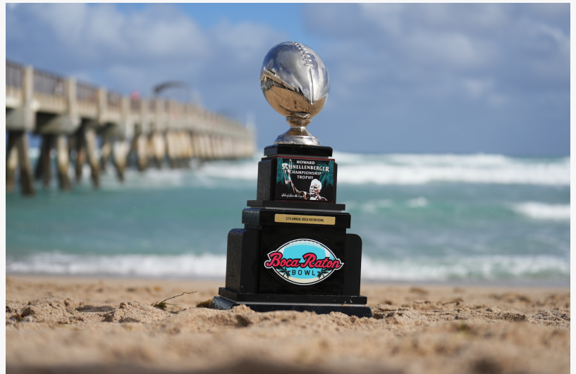
Boca Raton Bowl Trophy