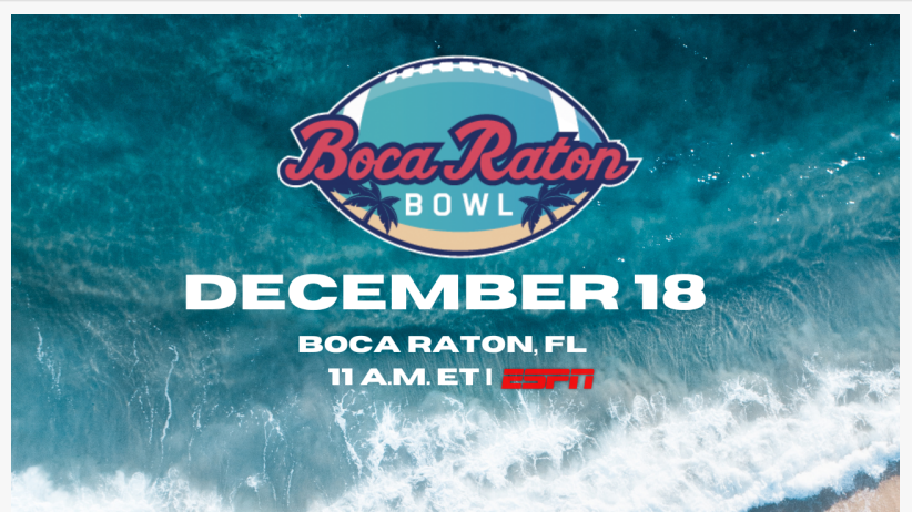
Boca Raton Bowl 2026

For more information, visit BocaRatonBowl.com and follow @BocaBowl on Instagram, Facebook,