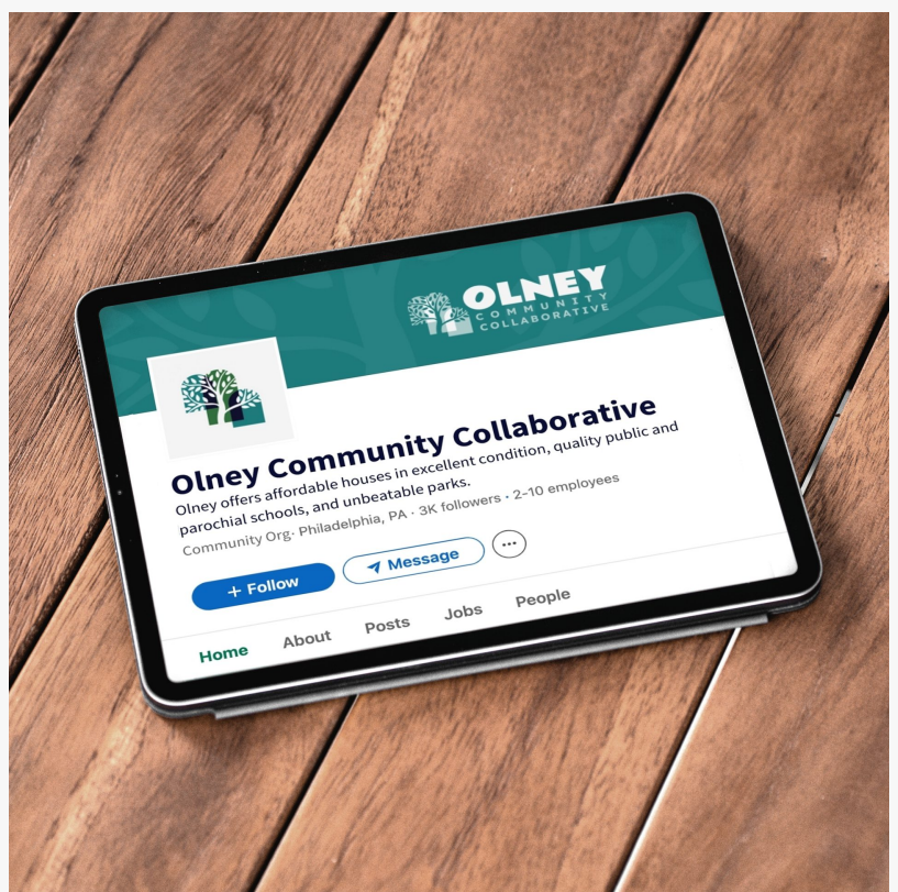
Creative Repute Develops LinkedIn Brand Presence for Olney Community Collaborative

Creative Repute, Inc. is a Philadelphia-based branding, design, and digital marketing agency that helps organizations strengthen their visibility, engagement, and impact through strategic communications, website development, branding, and creative services. The agency specializes in supporting nonprofits, educational institutions, government agencies, and mission-driven organizations.