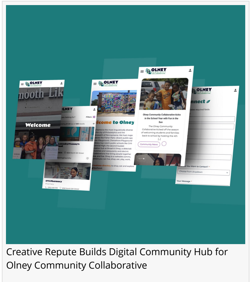
Creative Repute Builds Digital Community Hub for Olney Community Collaborative

This press release can be viewed online at: https://www.einpresswire.com/article/917126302