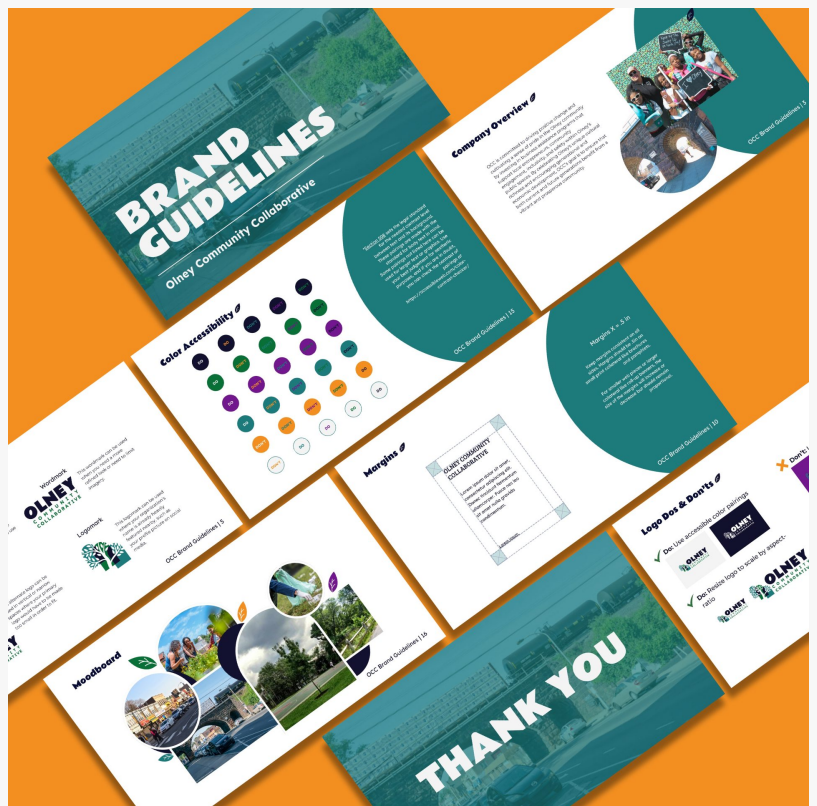
Creative Repute Creates Brand Guidelines for Olney Community Collaborative