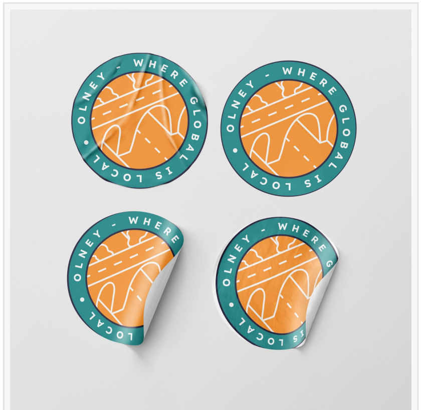
Creative Repute Designs Custom Sticker Series for Olney Community Collaborative