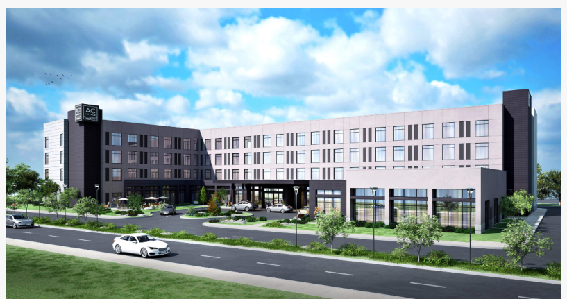
Construction of AC Hotel Research Park is expected to begin immediately with an opening anticipated in 2028.