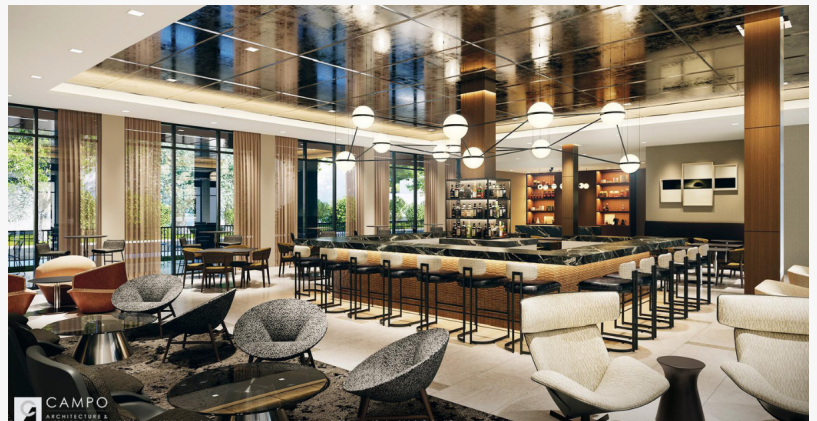
The project marks the first hotel development for the New York-based firm and the launch of a Southeast-focused hospitality platform with a second project already in development in Charlotte, N.C.