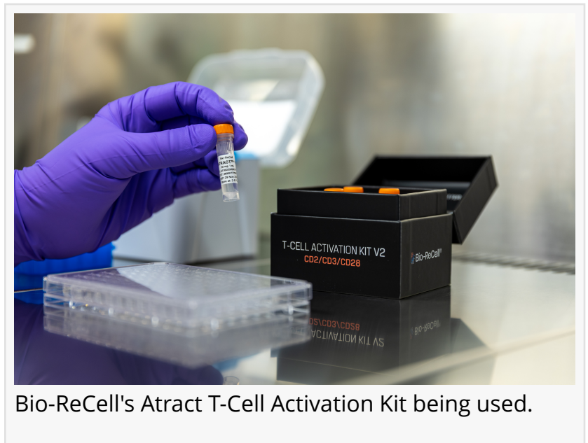
Bio-ReCell's Atract T-Cell Activation Kit being used.