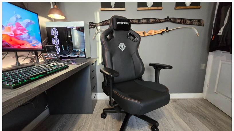
Kaiser 3 in Black AndaSeat

That concern aligns with public workstation guidance. OSHA states that a well-designed and appropriately adjusted chair is essential to a safe and productive workstation, and adds that increased adjustability improves fit, supports a variety of sitting postures, and is particularly important when a chair has multiple users. OSHA also notes that seat height should be adjustable, seat pans should support a range of seated postures, and chairs sized for larger users may be necessary in some cases.