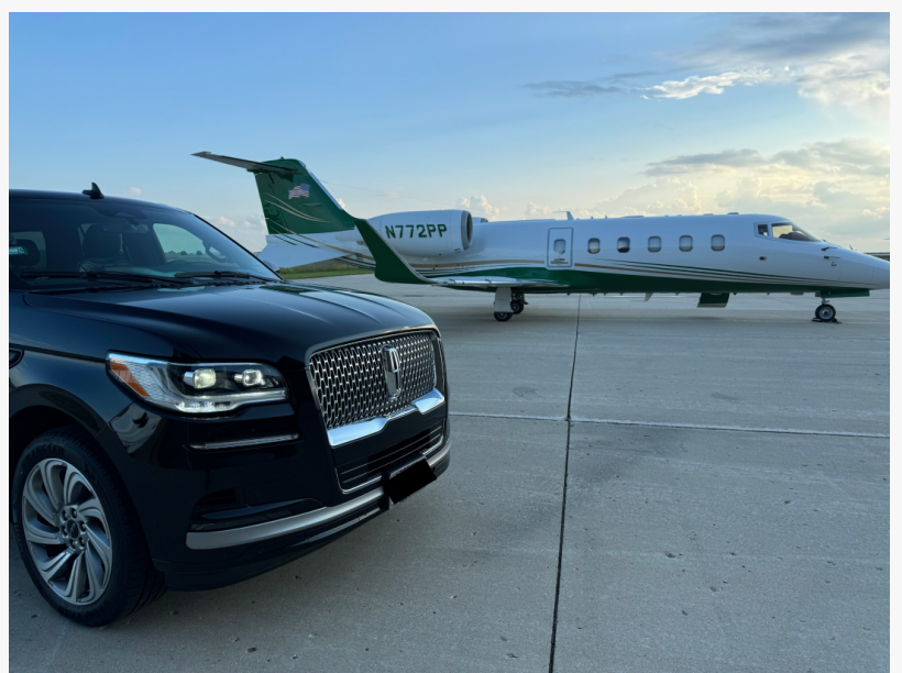
Lavish SUV Lincoln Navigator Ready to Pick Passengers at FBO

Nationwide Airport Coverage From a Chicago Operational Base