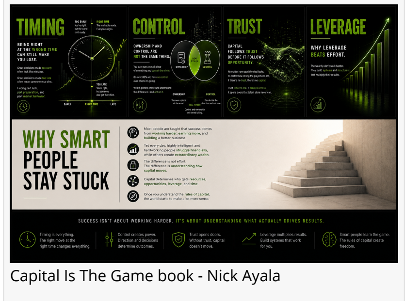
Capital Is The Game book - Nick Ayala