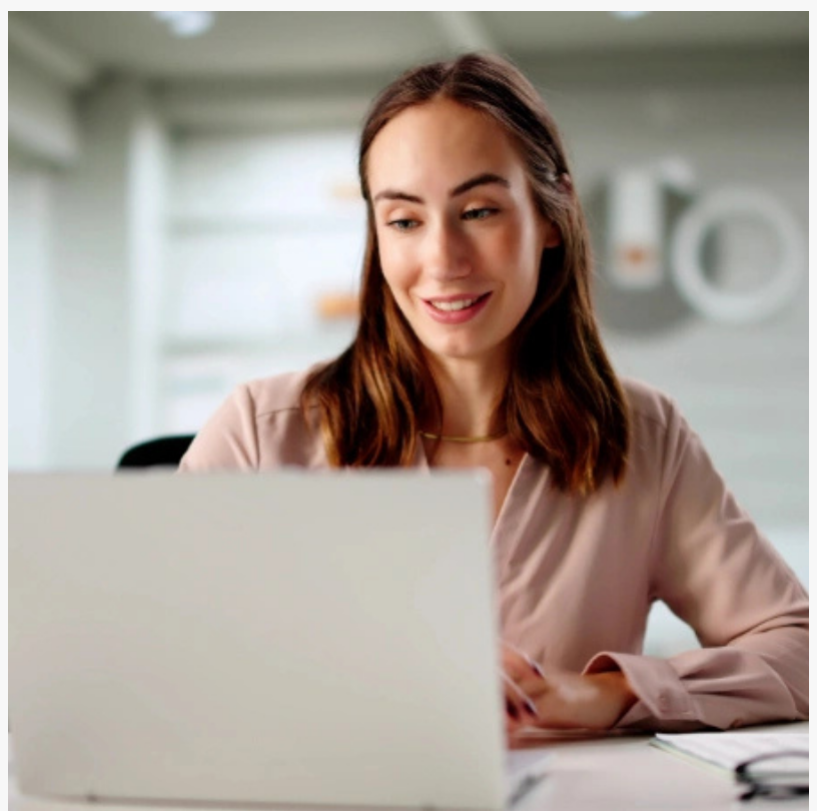
Shanti Recovery & Wellness Expands Treatment Across California with Medi-Cal Acceptance

This press release can be viewed online at: https://www.einpresswire.com/article/917661792